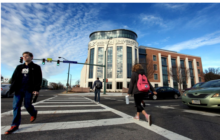
Crosswalk at 43rd Street and Hampton Blvd.