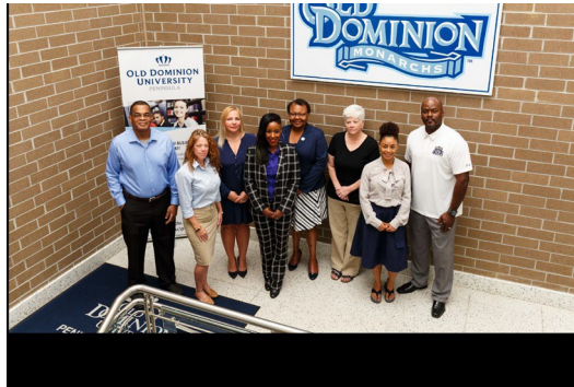
ODU Peninsula Center Staff

Our best wishes to you for a successful semester!