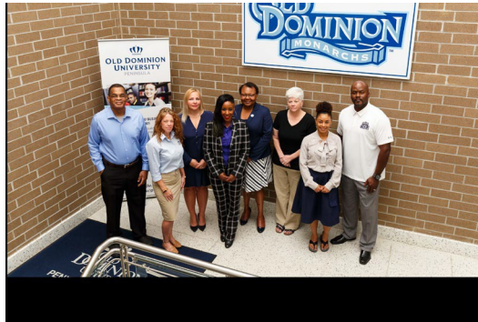
ODU Peninsula Staff

Our best wishes to you for a successful semester!