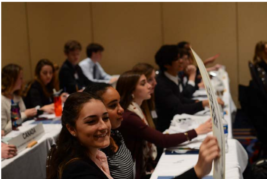
Voting at a General Assembly committee at ODUMUNC 39, February 2016