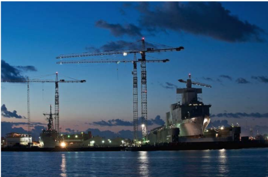
The Norfolk Naval Shipyard from the Sheraton Norfolk Waterside Hotel.

ODUMUNC offers its unique Faculty Forum, a one-day seminar on an issue in international affairs, with maximum classroom relevance. The event features professors from Old Dominion and other universities, regional political leaders and other experts. The series typically features six speakers in an informal seminar environment, with refreshments. Previous years' Faculty Forum have been on the Global Implications of Climate Change, Islam and World Politics, and Europe's Role in World Affairs. Old Dominion University offers Continuing Education credit for the Faculty Forum.