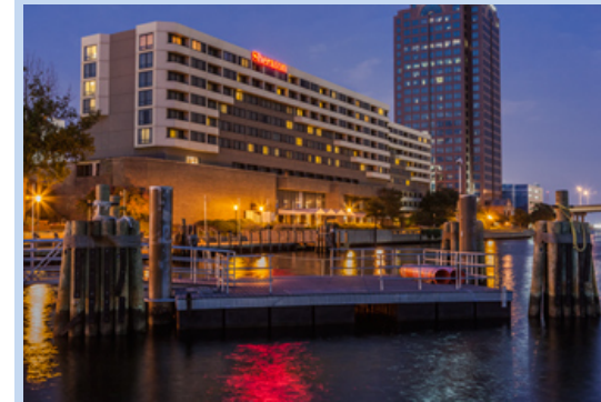
The Sheraton Norfolk Waterside Hotel.

From the South. Interstate 95 North to Route 58 East (toward Norfolk). Follow Route 58 East to I-264 East (toward Norfolk), through the Downtown Tunnel and Bridge. Take the Waterside Drive Exit.