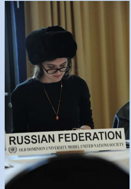
Security Council at ODUMUNC 39, February 2016