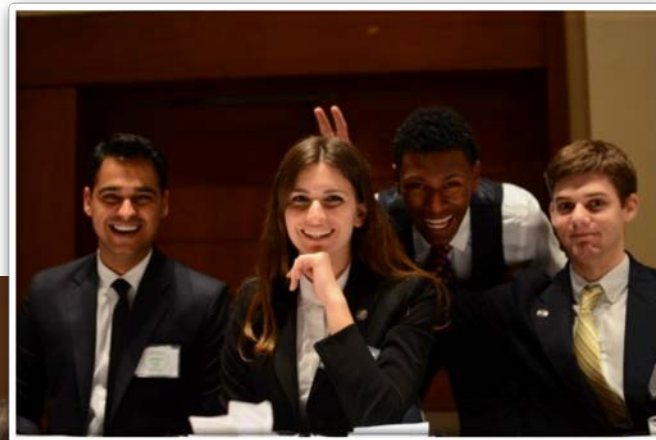
Scenes from ODUMUNC 39, February 2016