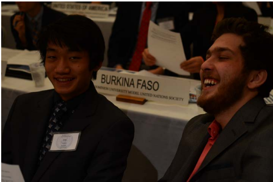
General Assembly at ODUMUNC 39, February 2016

Non-Voting: Eritrea Iran, Islamic Republic of Turkey Uzbekistan