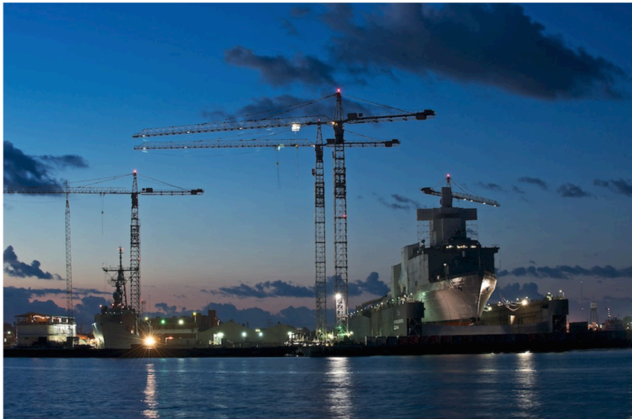
The Norfolk Naval Shipyard from the Sheraton Norfolk Waterside Hotel.

ODUMUNC offers its unique Faculty Forum, a one-day seminar series featuring Old Dominion professors, regional political leaders and other experts. The series typically features six speakers in an informal seminar environment with refreshments. Previous years' Faculty Forum have been on the Global Implications of Climate Change, Islam and World Politics, and Europe's Role in World Affairs. Old Dominion University offers Continuing Education credit for the Faculty Forum.