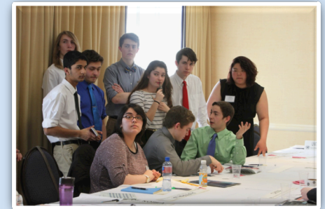
Security Council 2015