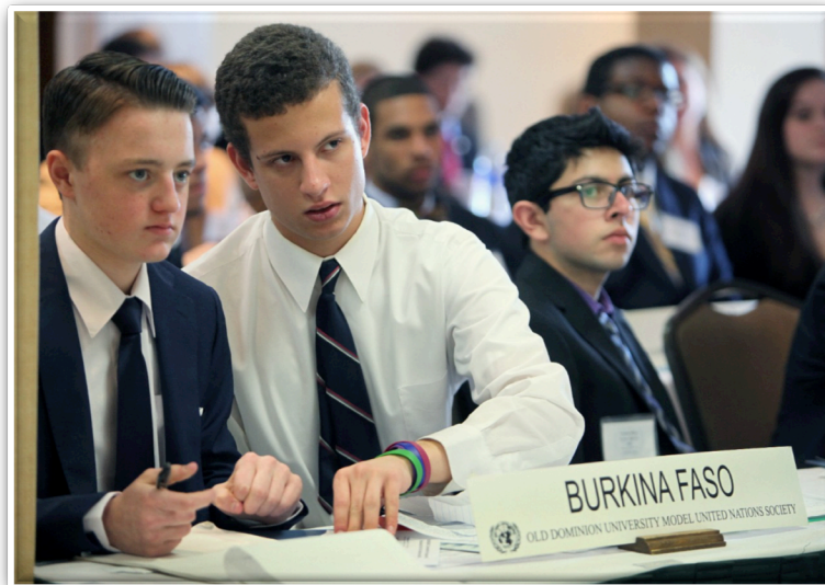
Human Rights Council 2015

Ad Hoc Committee of the Secretary General