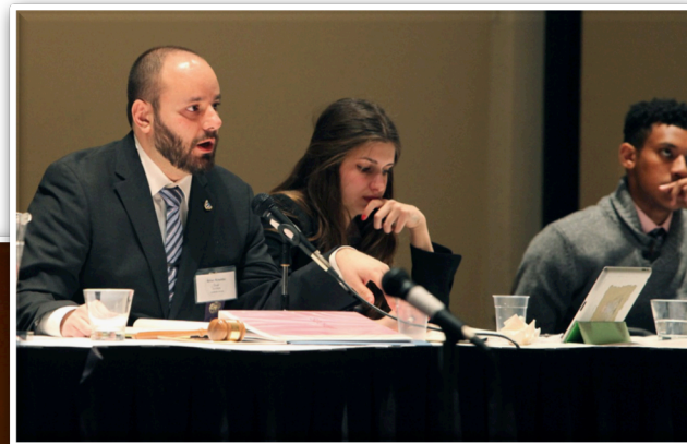
ODUMUNC staff at the 2015 conference