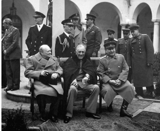
British Prime Minister Winston Churchill, U.S. President Franklin Roosevelt, and Soviet leader Joseph Stalin met at Yalta in February 1945 to discuss their joint occupation of Germany and plans for postwar Europe.

There are major alliances seeking the addition of members in the Security Council. In the selection of non-permanent members, Article 23 of the UN Charter lays down two criteria; members would be chosen for their contribution to the maintenance of International Peace and Security, as well as equitable geographical distribution. The first criterion has all but been disregarded when members come to the council. Lobbying is part of the process. Research found that financial aid from the US, for example, increases by 59%, and aid from the UN by 8% when a developing country rotates onto the Council. Aid also increases during the years in which key diplomatic events take place. In others words, seats and votes are so important, countries can bargain for them, essentially selling cooperation. 7