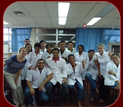
Students enrolled in the first dental assisting program.