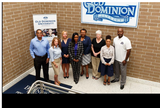
ODU Peninsula Staff

Our best wishes to you for a successful semester!