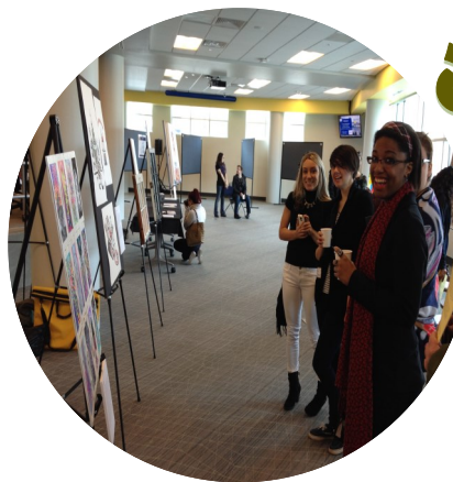
Chart Your Career Path